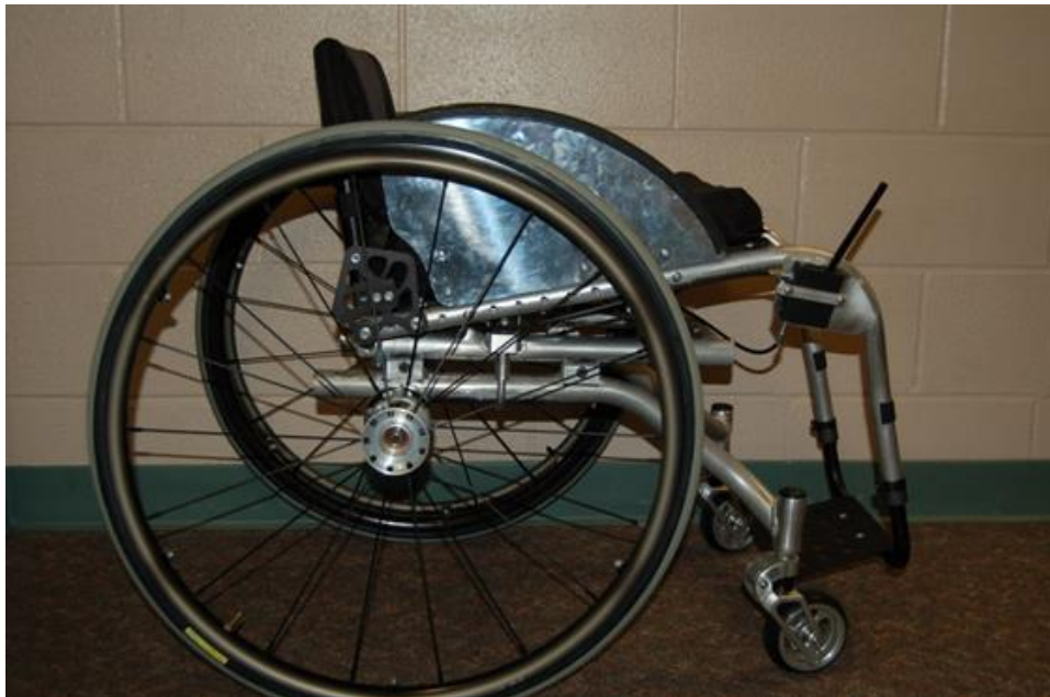
Fig. 20.3. The completed prototype in the hill climbing position.