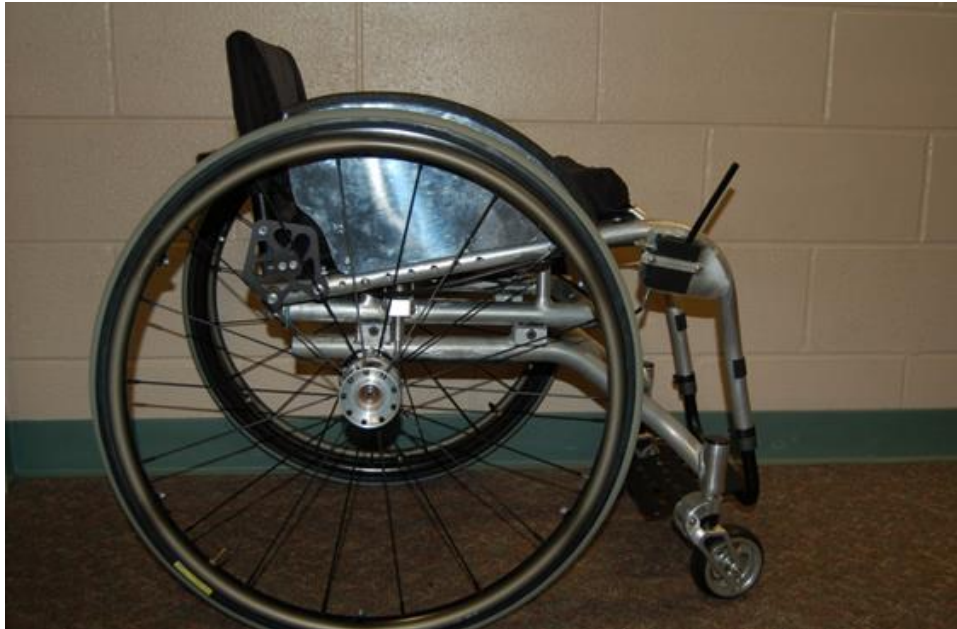
Fig. 20.2. The completed prototype in the tippy position.